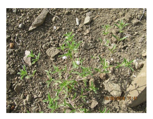
Figure 1. Satureja macrantha C.A. Meyer

It is a perennial plant, its body is numerous, slender, rod-like, hard as a tree, simple and weak, 30-50 cm high and branched. The leaves are numerous, linear or oblong-oblong, blunt. Bowled 5 mm long, tubular-bell-shaped, two-lipped, short, scattered hairy, bizarre teeth, 3 times shorter than the tube. Flower crown 12-15 mm long,