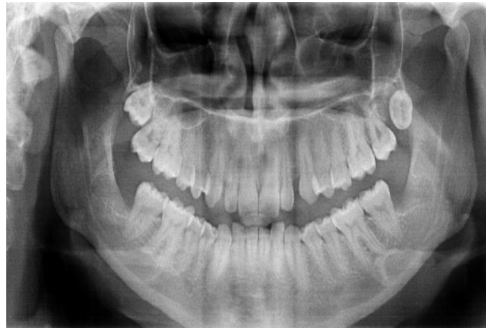
Figure 2. Orthopantomogram of the patient following the removal attempt of upper left 3rd molar

Maxillofacial Surgery, by a dental clinician who had unsuccessfully attempted to remove the left maxillary third molar under local anaesthesia on the preceding day (Figure 1). During intraoral examinations, the tooth could not be detected; thus, it was suspected to have been displaced upwardly through the infratemporal fossa (ITF) or buccal space. The patient had facial swelling on her left side, local pain during mandibular movements, and trismus. Mouth opening was limited to 1 cm. Visual activity and all other aspects of head and neck examinations were normal. Immediately, an orthopantomogram was taken, which showed that the left maxillary third molar had been displaced superiorly and posteriorly, possibly into the ITF (Figure 2).