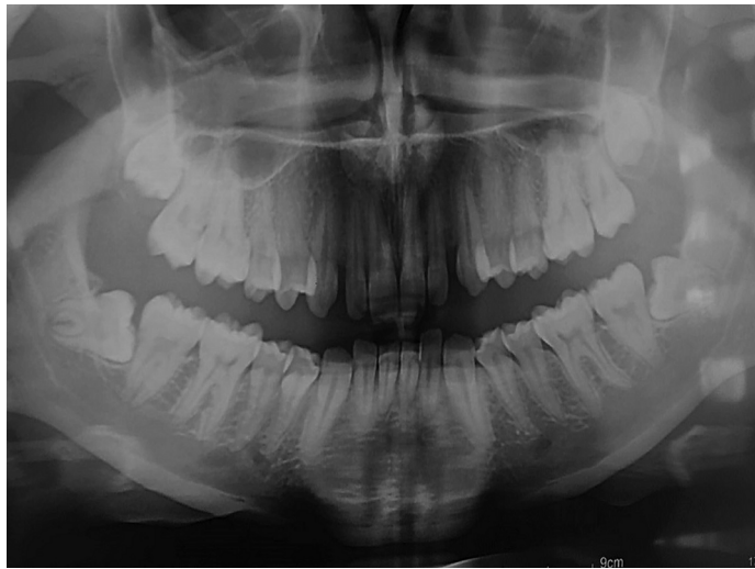
Figure 1. Orthopantomogram of the patient before extraction of upper left 3rd molar

The patient was administered 1 g amoxicillin and 1 g clavulanic acid (every 12 h), as well as a nonsteroidal anti-inflammatory drug (as needed) for 1 week to prevent infection. Seven days later, the patient showed improved mouth opening, however it remained insufficient for surgical intervention; pain remained on the left side of her face. She was instructed to return for consultation 3 weeks later. In addition, she was asked to return immediately if symptoms worsened.