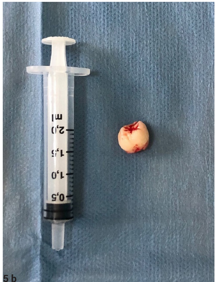
Figure 5 a. Hameostat holding the displaced tooth b. Removal of upper 3rd molar from infratemporal fossa