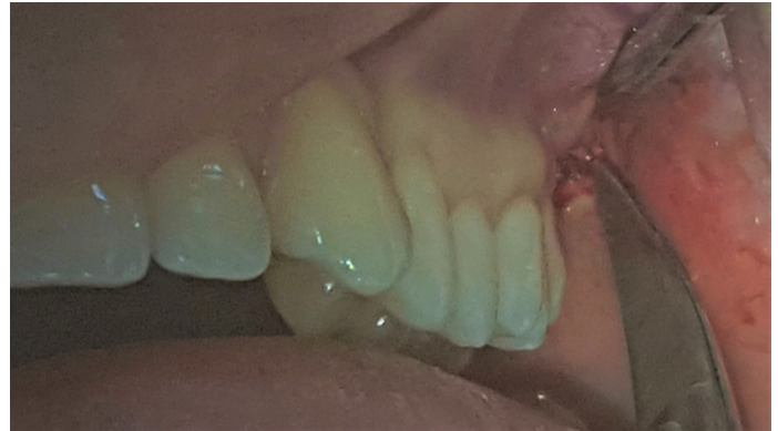
Figure 4. Dissection of the muscle fibers

Deep layers of muscle fibres were irrigated with 0.5% saline solution. The incision was primarily closed with a 3-0 silk suture material and the patient received the same medical regimen that had been administered during the postoperative period. No postoperative complications occurred during follow-up period.