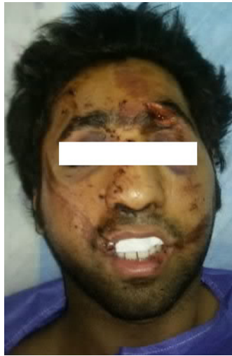
Figure 1. The patient before the surgery