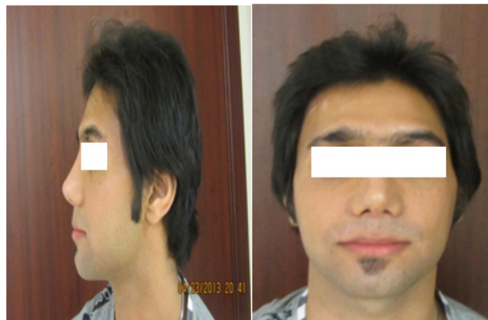
Figure 4. Six months after ORIF surgery and rhinoplasty