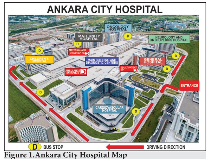
Figure 1. Ankara City Hospital Map

each block operates as a different branch hospital ( Supplementary figure 1 ). Total area of the hospital is 1,024,826 m 2 . The emergency room of the hospital has an area of 34,354 m 2 and has 115 stretchers. There are 2641 clinic beds (1295 for surgical clinics and 1276 for medical clinics) and 653 intensive care beds (191 for surgical clinics, 144 for medical clinics, 168 for reanimation clinic and 150 for newborn clinic). The capacity status of the closed hospitals are shown in Table 1 .