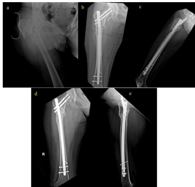
Figure 3: A 44-year-old male patient fell from a tree and presented to the emergency department with a Seinsheimer type 5 subtrochanteric femur fracture (a). His fracture was anatomically reduced using 3 cerclage cables and a Gamma Long nail was chosen as a fixation tool (b, c). At 7 months the patient is fully active and the fracture has healed without complications (d, e).

Figure 2: A 35-year-old patient with a Seinsheimer type 2 subtrochanteric femur fracture on her arrival after a high-speed trauma (a). The fracture was reduced and an AIMN implant was chosen to stabilize the fracture and no cerclage cables were required. Her early follow up radiographs (3 rd month postop) already show healing signs (b, c). The fracture site is completely healed at 9 months and the patient has returned to her daily activities (d, e).