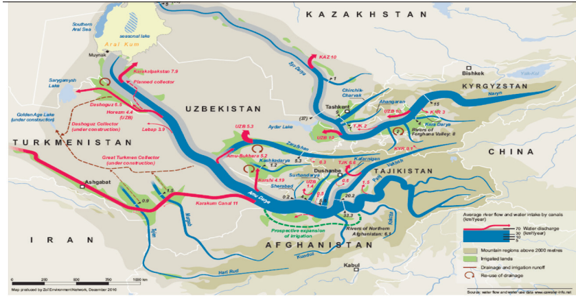
Map 1. Syr-Darya-Amu-Darya Rivers Flow Routes

Most of the water used in the region flows from the Syr-Darya and Amu-Darya Rivers originating from the Pamir and Tian Shan mountains.