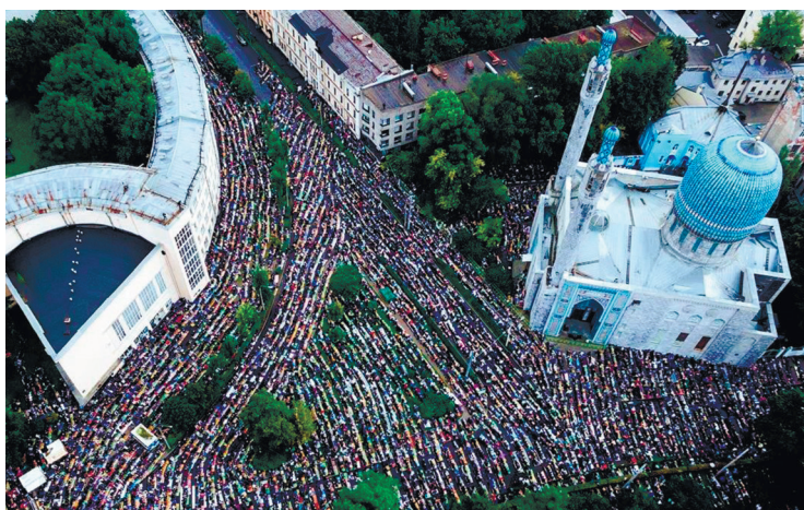
Figure 3. Aerial Photo of the Muslim Gathering at the Holyday Eid Al-Adha in St. Petersburg (Russia)

Communism provided the conditions for an Orthodox religious revitalization in Russia, with the former 'partially' occupying the place of State ideology (Huntington, 1996). According to survey data seemingly 70% of the current Russian population considers itself Orthodox, 12% are atheists and 6% are Muslims (Segrillo, 2015) 23 , thus placing Central Asians, in general, and Turkmen migrants, in particular, in the religious minority group. This reaffirmation of the Orthodox identity of Russia, albeit debatable in degree, is an element of contention with other sets of 'identities' within the Federation, such as the Muslims.