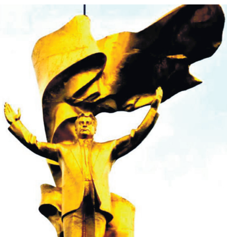
Figure 1. Golden Statue of Saparmurat Niyazov (Turkmenbashi) in Ashkhabad (Niyazov's 'Cult of Personality' takes physical form)

In 2001 a moral/religious guide written by Niyazov named Ruhnama (or Book of the Soul in Turkmen), became a compulsory reading in high schools and universities (Burke, 2014), turning into a local analogue of the Quran itself. Not long after the book's release, the knowledge of Ruhnama was also mandatory for professional certification in all institutions and organizations of Turkmenistan (Ria Novosti, 2006) 3 . Niyazov's presidency was indeed marked by numerous polemics and political setbacks for Turkmenistan. As an example, after an unsuccessful attempt to assassinate Niyazov in 2002, Turkmenistan witnessed an increasingly level of mass repressions and imprisonment.