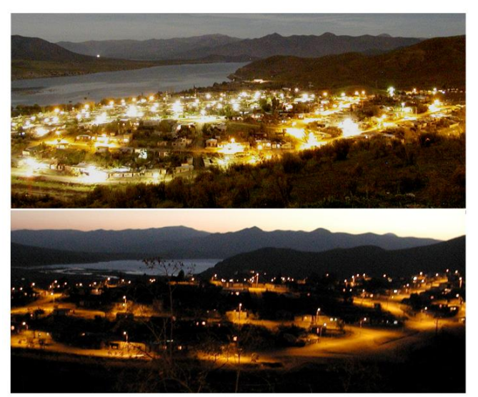
Fig. 3 Dark sky created by changing fixtures in Monte Patria, Chile [58].

In this way, energy and natural resources will be saved, lighting costs will be reduced, night security will be improved, living life and nature will be protected from a negative light, and the beauty of the sky will be preserved for the next generations [11].