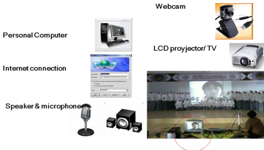
Figure: 3 Equipment of teleconference

The equipment needed to conduct teleconference can be divided into two (see figure 3 and 4); they are hardware and software. The hardware for teleconference activity is as follow: