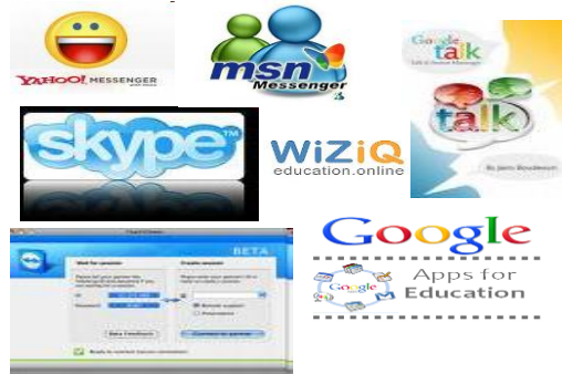
Figure: 4 Open source software for teleconference

The teleconference technology provides some software, which can be used to deliver video/audio teleconference. Most of this software is free or open access software, such as Skype, Yahoo Messenger, MSN Messenger, Wiziq and Google talk, etc. The Teleconference, which conducted by 100guru mostly use Skype and Yahoo Messenger programs.