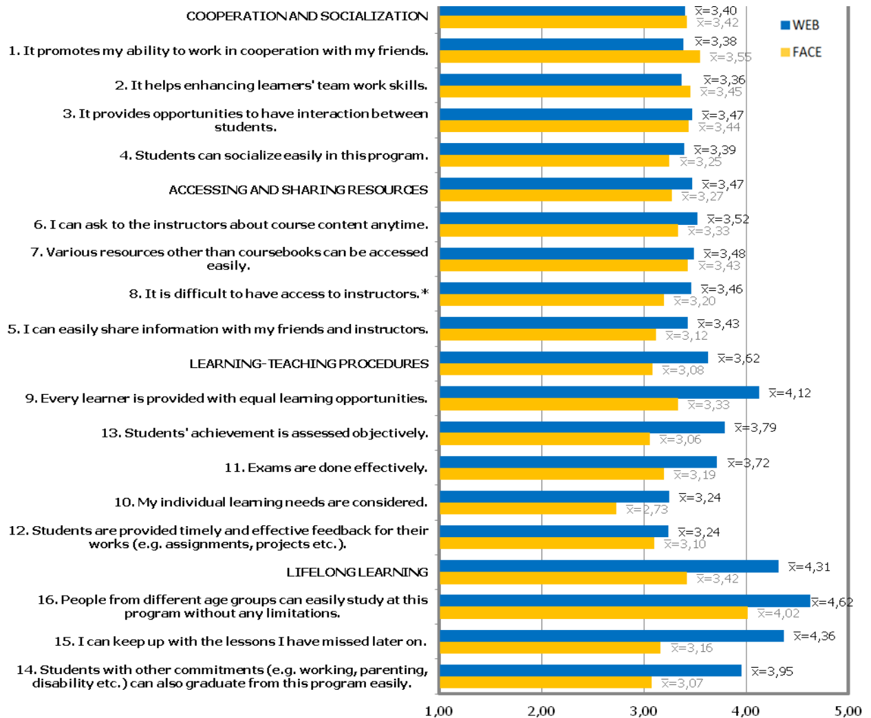
Figure: 1 Mean scores for items and factors regarding the students' perceptions about the quality of education in their programs (N= 536)

The mean score from lifelong learning factor indicated strong agreement ( \bar{x}=4.31 ) for web-based students, but just agreement ( \bar{x}=3.42 ) for face-to-face students. The items in the factor were scored ranging between slight agreement ( \bar{x}_{\min}=3.07 ) (mostly by face-to-face students) and strong agreement ( \bar{x}_{\max}=4.62 ) (mostly by web-based students).