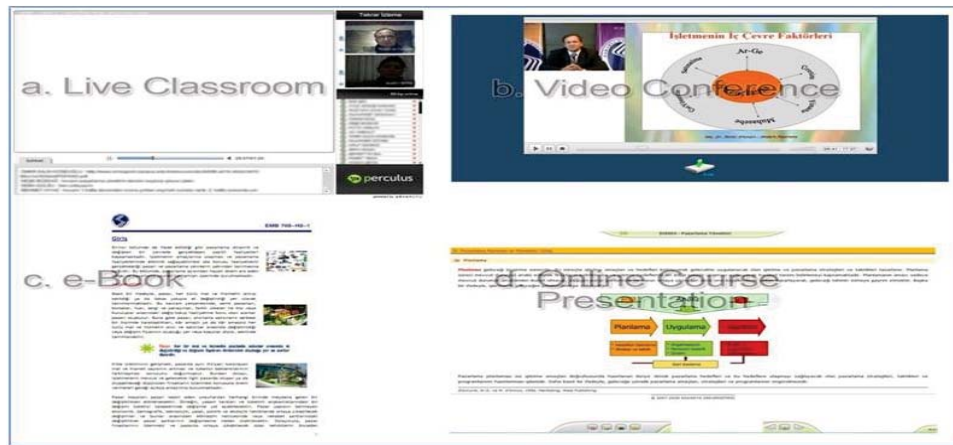
Figure: 2 Sakarya University e-Learning Portal

In this context, there are two hypotheses.