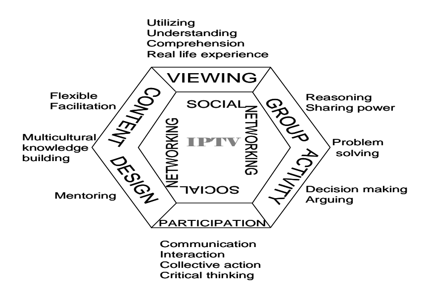
Figure: 2 Diamond of IPTV (It is the necessary point of view to generate successful constructivist distance learning environment and social networking in IPTV applications.)