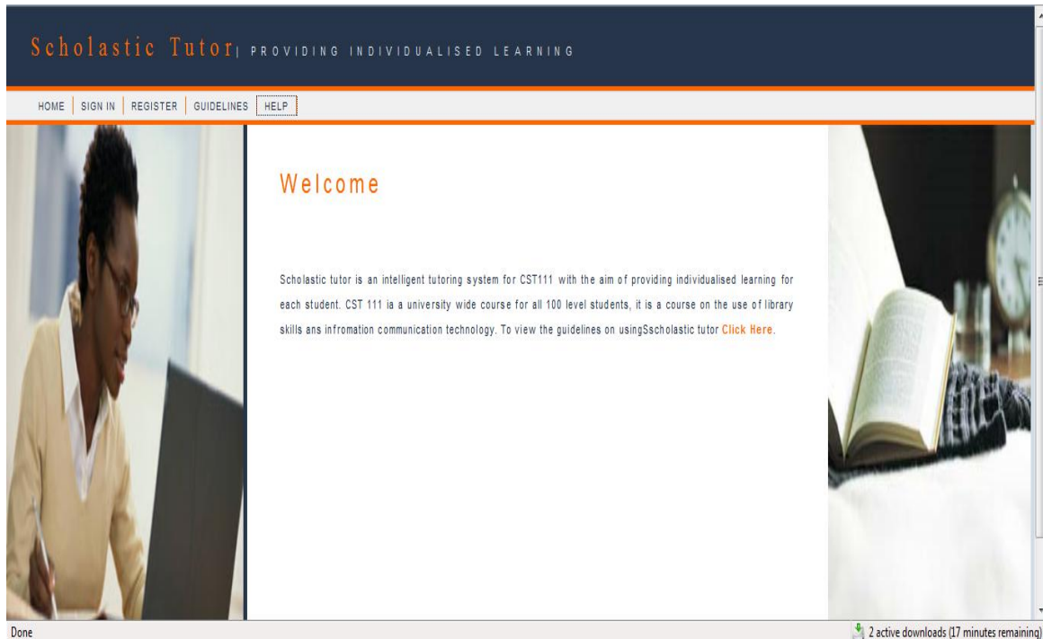
Figure: 3 Graphic user interface for the Home page of Scholastic tutor