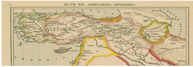
Photo 1. Anatolia in XI-XIIth Centuries