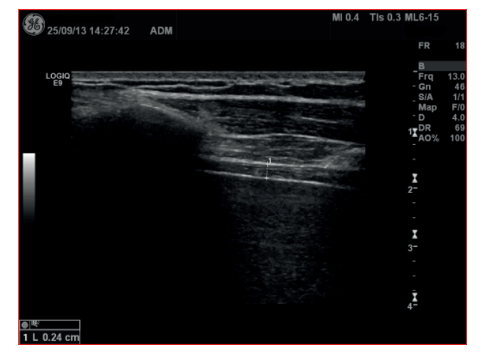
Figure 2. Ultrasound image of diaphragm thickness at endexpiration (2.4mm). The hypoechoic diaphragm muscle lies between two hyperechoic lines namely the diaphragmatic pleura and the peritoneal membrane.

The diaphragmatic thickness was 2, 03\pm 0.39 mm in females and 2, 06\pm 0.55 mm in males. There was no significant correlation between diaphragmatic muscle thickness regarding gender, age, and BMI (p>0.05). There was a moderate correlation between diaphragmatic muscle thickness and patients with mild COPD (r=0.62, p=0.017<0, 05). As %FEV1 decreased, the thickness decreased. There was no significant correlation between thickness and moderate and severe COPD (Tables II, III).