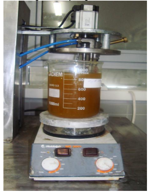
Figure 2. Dyeing Machine

dyeing is placed into the test containers. The test containers are placed in the machine and treated at 90°C for 60 minutes. After the dyeing process is completed, the dyed cotton fabrics are taken out and ventilated for some time. Then, they are rinsed with cold water, spread onto the drying paper and placed into the drier. The specimens are treated for 15–20 minutes at 60°C, after which they are taken out and ventilated.