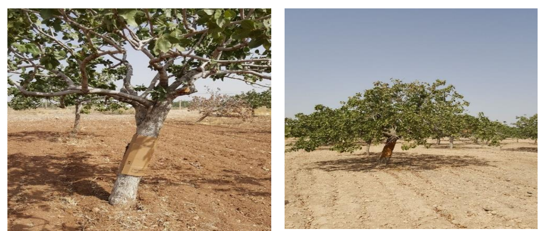
Figure 1. Artificial overwintering shelters established on pistachio trees.

species were appropriately preserved, tagged and diagnosed by subject experts.