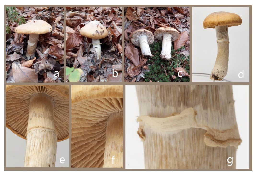
Figure 1. Cortinarius caperatus: a-d. fruit bodies, e,f. lamellae, g. annulus