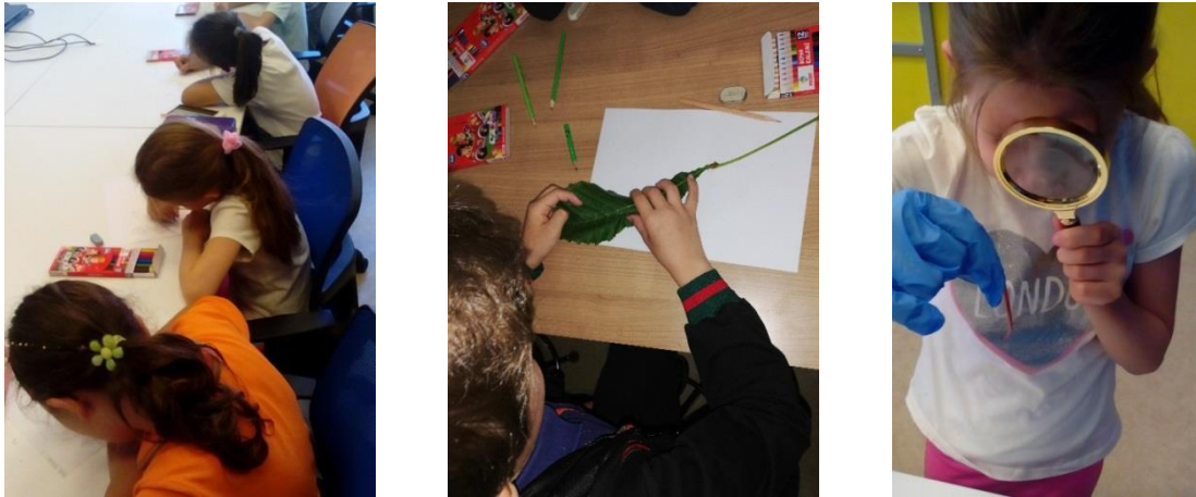
Figure 2. The activity processes