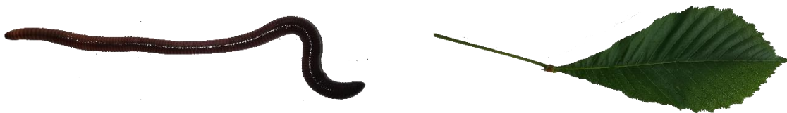
Figure 1. Entities observed in the activity

Prior to the activity, a focus group meeting was held to examine how the students perceived observation and how they performed it. After the interview was completed, a short break was taken to get the students' feedback and prepare the activity tools, and then the activity started. In the first step of the activity, students were given identical stationery materials, including crayons. They were asked to draw a worm and a leaf on the same paper separately based on their previous observations (past life experience). In the second step, sufficient time was given to the students to observe a leaf whose details are exact and a living worm in Figure 1. After observing, students were asked to draw the leaf and worm on the paper. In the third step, they were expected to observe the same beings through a magnifying glass. Students were expected to draw for the last time after using a tool, and they completed the activity.