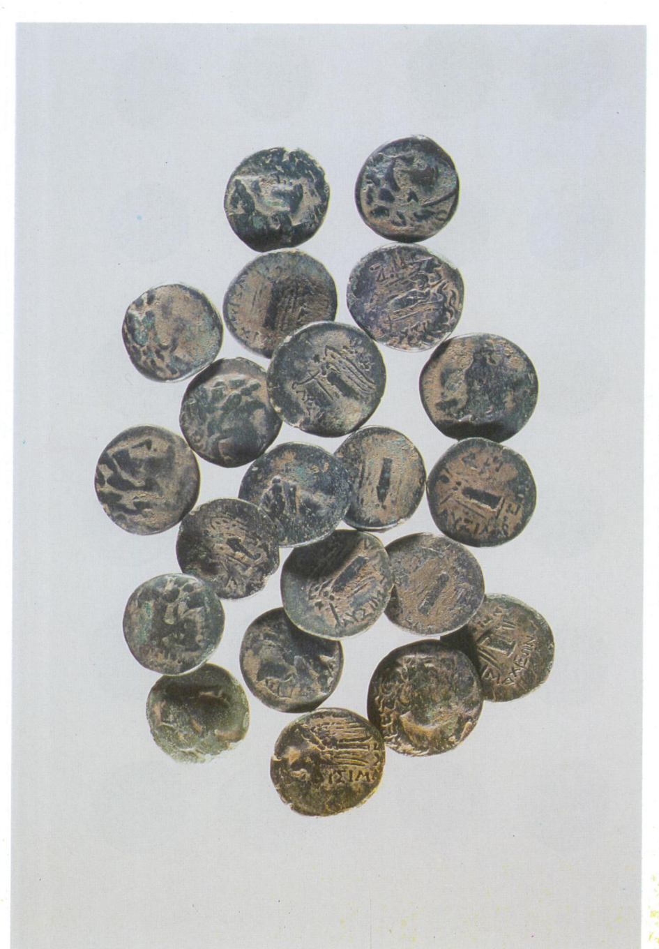
Lysimachia Definesi Genel Görünüm