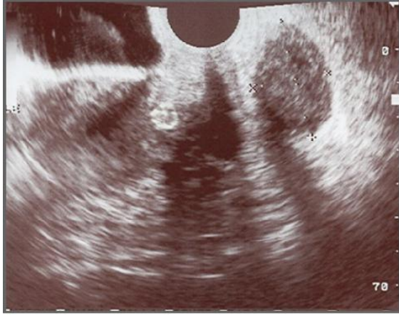
Picture 2. The transvaginal ultrasonographic view of the mass located at posterior to rectum.