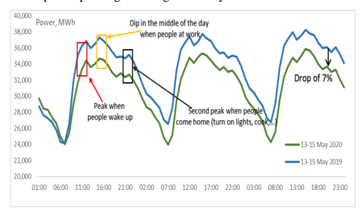
Figure 1. Electricity Demand for Turkey

As seen in Figure 1, there are three days of a demand pattern that has a general shape for Turkey (Teias, 2021). It chooses three weekdays; May 13th through 15th on 2020; Wednesday through Friday; and May 13th through 15th 2019, a Monday through Wednesday (Teias, 2021). The situation pre-Covid, pre-stay at home works; there's sort of a dip and a flattening when people move from residential buildings into commercial buildings in the middle of the day. There's a second peak when people come home, they start cooking and turn on electric stoves, TVs, lights. This curve is the general trend of electricity consumption; it can be seen in most cities. When it is compared to those same three days in 2020; it is seen that the overall demand shape is relatively consistent. It's a little bit flatter and hard to see in the Figure-1 but overall, it has a 7% reduction. There has been a big decrease in commercial buildings consuming less electricity. A lot of businesses shut down to people moving at home and consuming more electricity during the day. It is a very interesting shift in electricity consumption that's resulted in fewer power plants turning on and fewer power plants generating electricity.