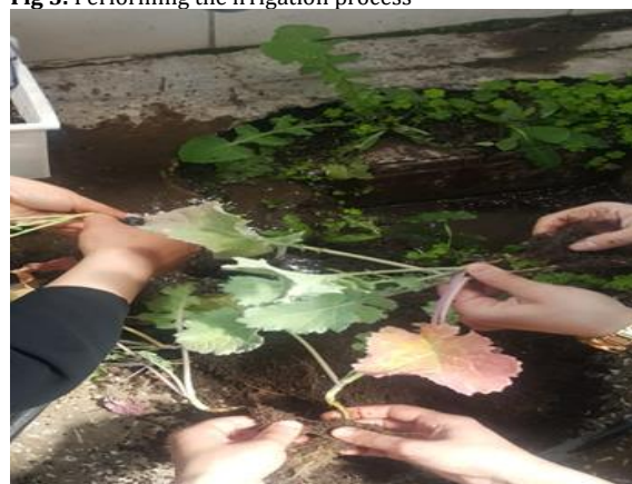
Fig 4. Performing the harvesting process