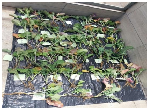
Fig 5. Performing the drying process