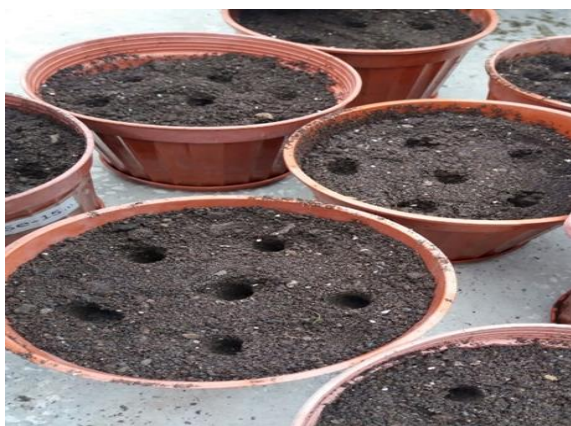
Fig 1. Sowing of canola seeds

The experiments were carried out by giving water in different lead concentrations of 25 ppm, 50 ppm and 75 ppm to the plants under greenhouse conditions. 9 pots were used by working in 3 repetitions for each determined lead concentration. In addition, 3 different pots irrigated with tap water were used as control plants in the study. Lead solutions were added to the pots in the indicated repetitions and concentrations as use all the soil capacity. Lead solutions were obtained by dissolving Pb(NO_3)_2 in tap water, and the water requirement of the plants was met with prepared lead solutions. Irrigation with lead solutions was carried out after germination to prevent the plant from dying. The study was carried out for the absorption of heavy metals added to the pots by the soil in a growing cabinet with 10-12°C of night temperature, 25-30 °C of daytime temperature and 30-40% of humidity for 12 hours of illumination and 12 hours of darkness for 3 months. The germination of canola seeds is shown in Fig 2.