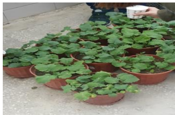
Fig 3. Performing the irrigation process

harvesting process and the drying process are given respectively in Fig 3, Fig 4, and Fig 5.