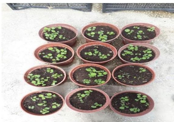
Fig 2. Germination of canola seeds

The experiments were carried out by giving water in different lead concentrations of 25 ppm, 50 ppm and 75 ppm to the plants under greenhouse conditions. 9 pots were used by working in 3 repetitions for each determined lead concentration. In addition, 3 different pots irrigated with tap water were used as control plants in the study. Lead solutions were added to the pots in the indicated repetitions and concentrations as use all the soil capacity. Lead solutions were obtained by dissolving Pb(NO_3)_2 in tap water, and the water requirement of the plants was met with prepared lead solutions. Irrigation with lead solutions was carried out after germination to prevent the plant from dying. The study was carried out for the absorption of heavy metals added to the pots by the soil in a growing cabinet with 10-12°C of night temperature, 25-30 °C of daytime temperature and 30-40% of humidity for 12 hours of illumination and 12 hours of darkness for 3 months. The germination of canola seeds is shown in Fig 2.