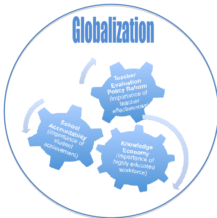
Figure 1. The knowledge economy, accountability, and teacher evaluation policy reform in the context of globalization