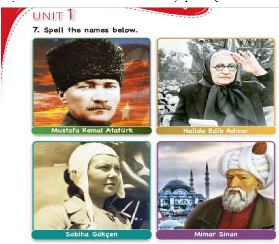
8. Spell your name.

The first item suggests the use of non-native and non-standard accents of English. The book hardly meets this expectation. It introduces some Turkish names as well as foreign names (Figure 1 and 2); however, when all of the listening tracks were played, it was observed that there was no different accent or variety of English. The book presents only British English to the students and Turkish characters use standard British accent. The students are not exposed to the different accents and varieties; although most of the interactions in English happen among non-native speakers in the expanding circle. Similarly, the studies done by Genc and Meral (2020) and Atar and Erdem (2020) who utilized the same rubric revealed that English textbooks used in public schools do not familiarize the students with non-standard accents of English. These inadequacies in the books actively show that coursebooks should endeavour to introduce different accents and non-native speakers. This is in order to prepare the students for the real communication context and demonstrate that English is not only spoken by British and Americans. Non-native speakers are capable of communicating well in English. In the outer world, the learners would meet these non-native people; thus, they need to know but also understand how they speak English.