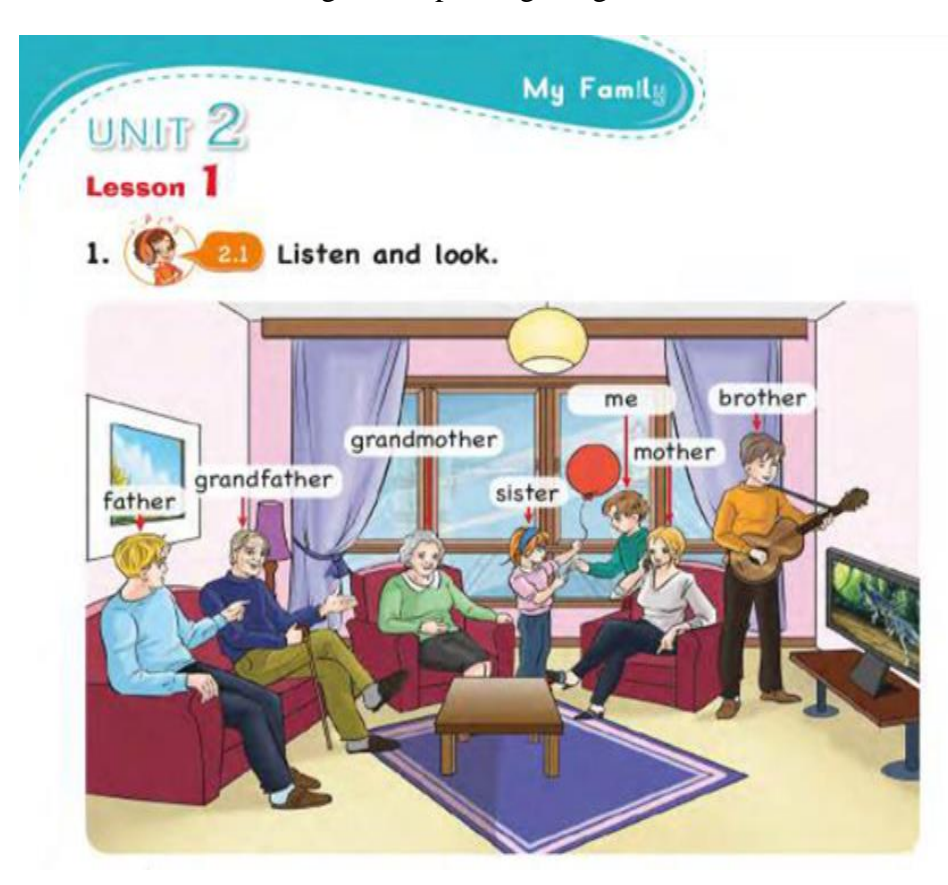
Figure 5. Family concept similar to Turkish culture

unit 2, My Family, gives the family concept analogous to Turkish culture. For example, grandparents generally live with their children and this unit shows the family pictures included grandparents (Figure 5). As Alptekin (2002) recognised, "The more the language is localized for the learners, the more they can engage with it as discourse" (p. 61). Also, Turkish students do not use English outside the classroom and the activities in this book are largely art-crafts; therefore, it could be more effective if the students are given a speaking assignment.