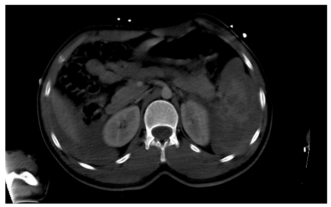
Figure 1. Grade IV spleen laceration

The most common complications encountered in patients undergoing splenectomy due to trauma or liver repair are wound infection, pneumonia, sepsis, and ARDS. Non-operative follow-up of patients with blunt abdominal trauma reduces the duration of hospital stay as well as protecting the patient from the possibility of postoperative complications (27,28). In this study, the duration of hospitalization of the patients who were followed-up without surgery was found to be significantly lower. On the other hand, the most common complications are bilioma, pseudoaneurysm and intraabdominal abscess in patients with non-operative follow-up (29,30). In this study, no complication was detected in the patients without surgery who were followed up, and 4 of the operated patients developed an infection