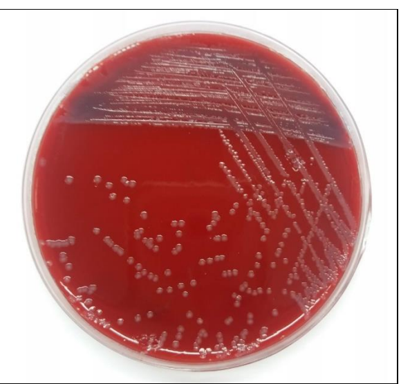
Figure 1. Growth of Salmonella Typhi on Blood Agar.

susceptible to ertapenem, imipenem, and meropenem. The isolates were resistant to ciprofloxacin & intermediately susceptible to levofloxacin. The susceptibility to azithromycin (15 µg) was performed by Kirby- Bauer disc diffusion method (Figure 3). Results for azithromycin were interpreted as per the CLSI [7]. All three isolates of S. Typhi had inhibition zone sizes of ≤12 mm and were reported as resistant to azithromycin. The patient was administered meropenem parenterally. He became afebrile after 3 days and the antibiotic was continued for another 4 days. The patient was advised to continue to follow up in the cardiac outpatient department.