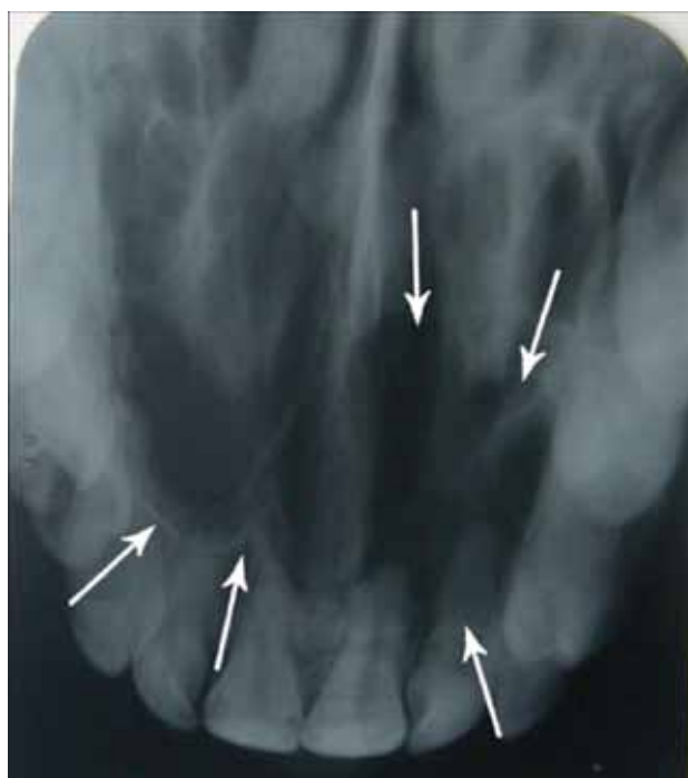
Figure 2: A large radiolucency on the anterior of hard palate on occlusal radiographic view

Occlusal radiographic investigation revealed a large radiolucency on the anterior of hard palate (Figure 2). Panoramic radiography showed round process (more dense than air) with sclerotic border and radiolucency with partially sclerotic border from right premolar to left canine in alveolar process (Figure 3). The area was examined with conventional Computed tomography (CT) to evaluate bone involvement. Coronal and axial CT images showed expansive process occupying most of right maxillary sinus with a very thin sclerotic border (Figure 4,5,6).