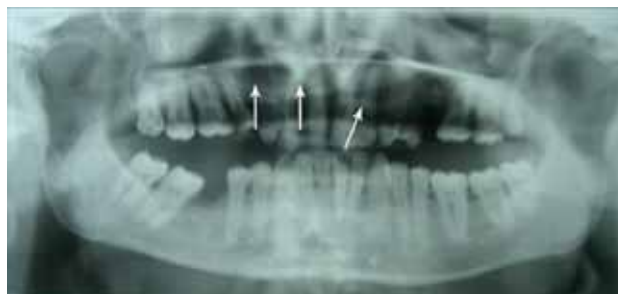
Figure 3: Panoramic radiography showed round process (more dense than air) with sclerotic border and radiolucency with partially sclerotic border from right premolar to left canine in alveolar process