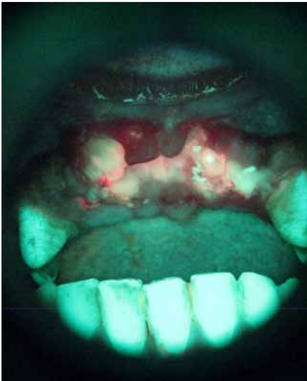
Figure 2: Dark area is VEL-scope- positive, which was confirmed by biopsy as Verrucous Carcinoma (VC)

or carcinoma (Fig. 2). Histopathological characteristics of the excised specimens revealed acanthosis, papillomatosis and hyperkeratosis of the epithelium of the lesion, continuing with characteristics of healthy mucosa. Squamous epithelial cell composition of the tumor did not give a definite atypical character, but showed blunt rete processes towards the sub-epithelial area. Lymphocyte infiltration was noted in the periphery of the tumor islands.