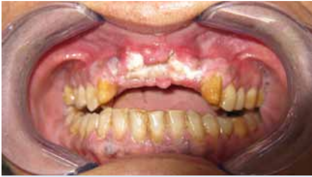
Figure 1: Exophytic, white keratotic view under white light examination.

still had these white lesions with swelling and pain this time. Thereon, the dentist who made the prosthetic rehabilitation undertook antibiotic treatment and referred the patient to our hospital (Fig. 1). Initially, fluorescence visualization examination (FVE) was performed by the assistance of VELscope (LED Dental Inc., White Rock, Canada) to decide the most favorable biopsy region. Concurrently, diascopy was conducted to set aside eventuality of inflammation. Two excisional biopsies were taken from two different and dark-colored fluorescence visualization loss (FVL) regions where it was considered as a potential carcinoma in situ (CIS)