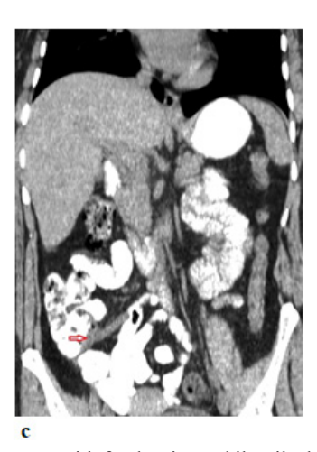
Figure1 . a) Coroner section of CT of the abdomen revealed 2 cm target-like mass, tumor with fat dansity and ileo-ileal intussusception. b) Axial section of CT of the abdomen that showed ileo-ileal intussusception. c) CT image of signs of appendicitis. (increasing on appendix diameter, edema)