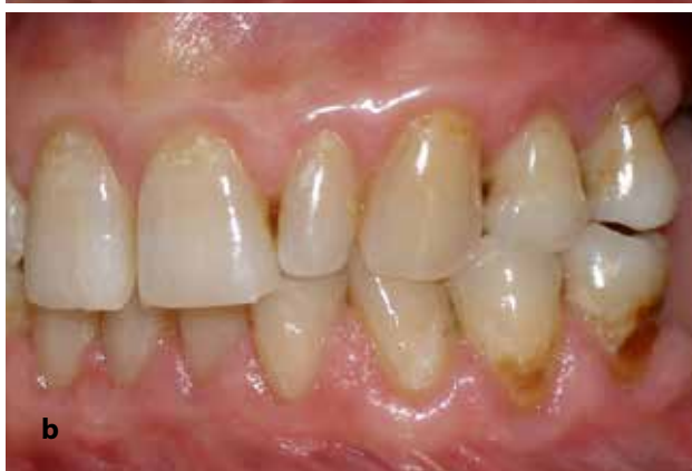
Figure 6: Clinical view from the (a) right and (b) left side after the ulcerated lesions had disappeared.