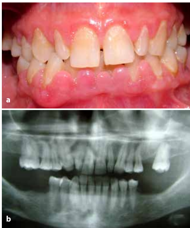
Figure 1: (a) Clinical view on the day the patient presented. (b) Panoramic radiography showing minimal horizontal bone loss.