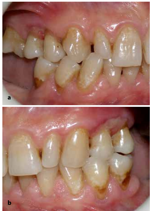
Figure 3: Ulcerated lesions on the (a) right and (b) left premolar regions of the attached gingiva.