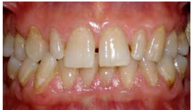
Figure 2: Clinical view 3 months after initial periodontal therapy.

replaced CsA with tacrolimus (4 mg/day), the sera level of tacrolimus was 5.5 ng/ml. Nifedipine treatment was not changed. Nonsurgical periodontal therapy consisted of scaling/root planning under antibiotic prophylaxis was started after consultation and repeated once a week for 1 month. Then recall and control sessions were repeated