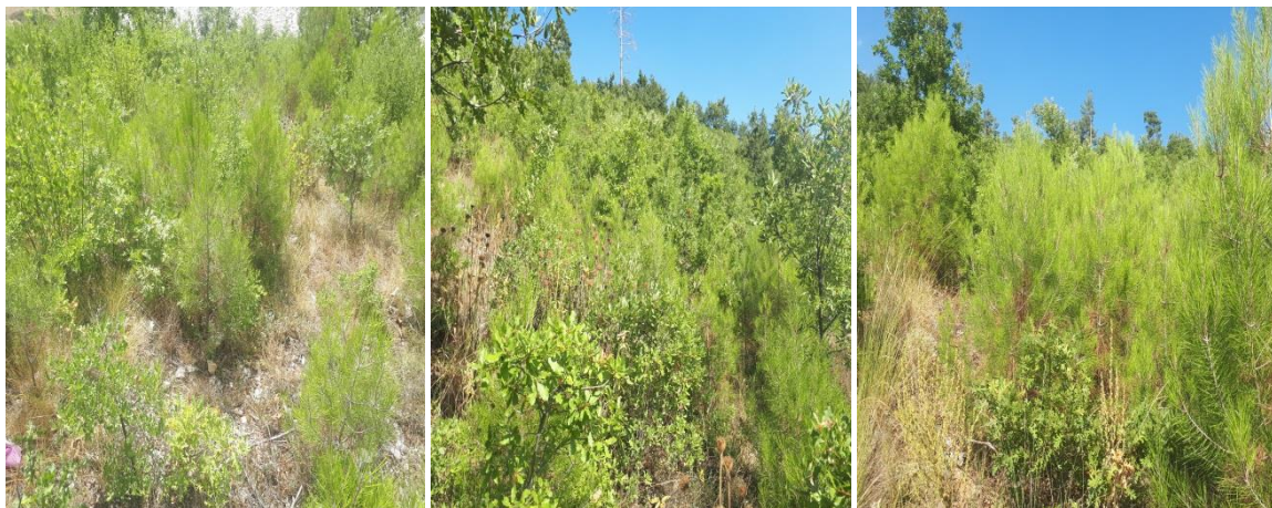
Figure 1. Sampled areas (upper, middle and low from left) in the study.

Regeneration areas were sampled randomly as 100 m 2 (10x10 m) for each slope class given above from 4 years old natural regeneration area at same location of Brutian pine at end of growth period of 2020. Height of reproduction called also seedling in this study ( SH ) and root-collar diameter ( RCD ) of each natural reproduction were measured. The following linear model of variance analysis was performed for comparison of the growth characteristics according to slope groups: