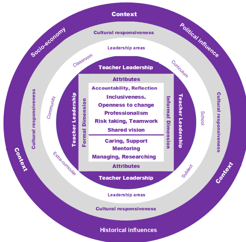
Figure 2. Conceptualisation of TL