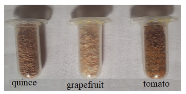
Figure 1. The image of the samples obtained.

The moisture content, ash, pH, crude protein, crude oil analyses were done as proximate analysis; water binding capacity (WBC), oil binding capacity (OBC), swelling ca-