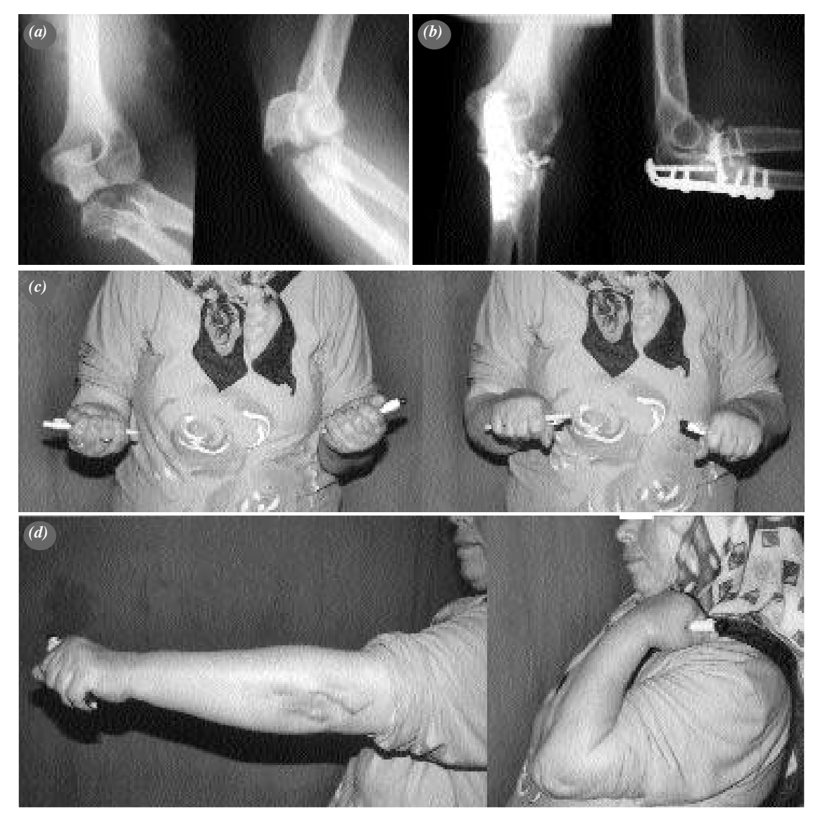
Picture 2.(a) displaced fracture of the olecranon and comminuted fracture of the radial head. (b) Pseudoarthrosis of the radial head fracture and loosening of the mini-plate. Postoperative (c) supination and pronation and (d) flexion and extension of the elbow joint.

The rate of good and perfect results in type III radial head fractures is lower. For this reason, for type III radial head fractures determined either by radiography or during operation as multi-comminuted, it is suggested that internal fixation methods should not be employed and that anthroplasty or resection alternatives should be eval-