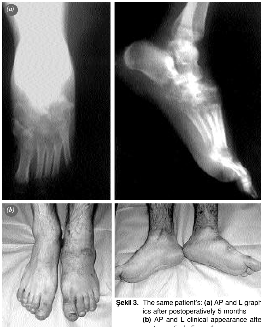
Şekil 3. The same patient's: (a) AP and L graphics after postoperatively 5 months (b) AP and L clinical appearance after postoperatively 5 months.

Foot and Ankle Society) scoring system. In the first month after the circular external fixator device, all patients limped. At the end of the sixth month, limping has disappeared completely in one patient; it continued in a smaller amount in two of them but remained permanently in one patient. After the device is taken off, the ache occurring while walking disappeared getting smaller in 3-6 months; it remained permanently in one patient. For all patients, after the CEF devices are taken off, the decreased ankle movements recovered completely at the end of the first month. In the physical inspection, advanced decrease has been determined in comparison with the healthy foot in the rear foot and tarsometatarsal joint movements. When compared with the healthy foot, valgus increase has been seen in