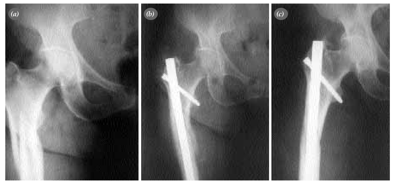
Figure 2. a) Pre-operative roentgenography of the patient aged 61 years. b) Anteroposterior roentgenography of the patient during the early postoperative period. c) Anteroposterior roentgenography of the patient at 12th post operative month showing union of the fracture.

Subtrochanteric region covers the area between the lesser trochanter and the isthmus of the diaphysis of the femur. Since it is the transition zone between the spongious bone and cortical bone and its vascu-