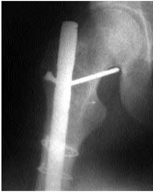
Figure 3. Closed oblique fracture on 1/3 proximal-to-mid femur due to motorcycle accident. in a 29 years old man. Note that breakage of the proximal interlocking screw following application of top compression.

Mean operation time from the skin incision to the closure of the wound was 105.7 \pm 22.3 minutes. No patient developed breakage of the nails or screws. But proximal interlocking screws in two patients were broken deu to squeezing during the compression applied (figure 3). No problem of nonunion was seen in these 2 patients with broken proximal screws. Additionally, curving occurred due to early loading at the level of fracture line on the 4th week in the intramedullary nail on the right femur of a patient with bilateral femoral fractures. Union was achieved without complication on the 28th week in this patient in which the nail was changed. Serclaging was performed in 4 patients in whom breakage occurred on the injury time or during nailing. Serclaging was not performed in other patients. In one patient, the guiding wire