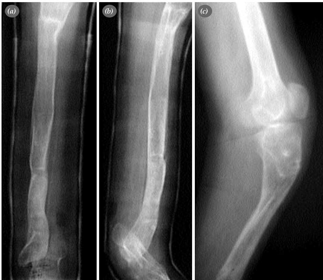
Figure 3. (a) Plain anteroposterior and (b) lateral graphs at postoperative month 15. (c) Lateral graph at month eight (first operation).

The foot component was combined with the tibial component as to perform deformity correction without restriction (without hinges). Four Kirschner wires were properly inserted from the proximal ring of the tibia while two Kirschner wires from each medial and distal rings and calcaneus and forefoot. Two of the K wires inserted from the proximal ring were fixed to the ring by means of one-hole posts, providing two levels at the proximal of the osteotomy line. The operation plan included lengthening by proximal osteotomy; deformity correction and