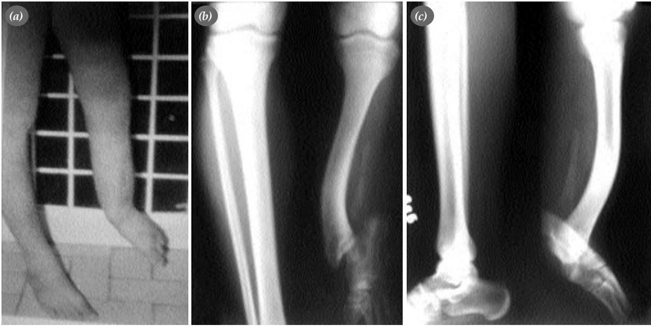
Figure 1. Preoperative (a) clinical presentation, (b) anteroposterior and (c) lateral graphs of the patient with a shortness of 16 cm in his foot.

days/month). Patients received psychological support from the psychologists throughout the treatment.