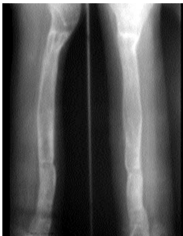
Figure 5. After the removal of the apparatus, anteroposterior and lateral graphs at month three (second operation).

thesis is applied at first using Syme or Boyd amputations. Although this method has positive aspects like achieving outcome in a shorter period of time, shorter hospital stay and easy patient compliance, it is irreversible. [10] Numerous studies used Syme or other amputations for treatment. [10-12] Even tough we recommended amputation to the patients with type