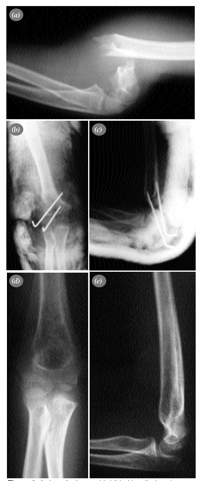
Figure 2. A view of a 8 year old child with a displaced supracondylar humerus fracture, (a) preoperative; (b,c) early postoperative in a posterior splint after closed reduction and percutaneous lateral pinning;(d,e) anteroposterior and lateral views at the 14th postoperative month.

After the last fluoroscopic control, the elbow was placed in a splint at approximately 90° flexion. The pins were paralel in 11 children and crossed in 23 children. Three K-wires were used in five patients to augment the stabiltiy and two K-wires in twentynine patients. The operating surgeon's own decision was effective in choosing either parallel or closed wires. All the patients were observed 24 hours for edema and neurovascular complications postoperatively and the next day they were discharged after the radiographic control. Radiological and clinical controls were made with a one week periodic time. The pins were removed after radiological healing and then active exercises were started. The mean duration of fixation was 3.8 weeks (range 3 to 6 weeks). At the last follow up, anteroposterior and lateral graphies were taken. Baumann's angle was measured on anteroposterior radiographs and humerocapitellar angle were measured on lateral radiographs. The results were compared with the normal side. The range of motion of the elbow was assessed clinically. The results were evaluated according to the criteria of Flynn et al.<sup>[26]</sup> after a mean follow up of 22.6 months (range 10 to 48 months).