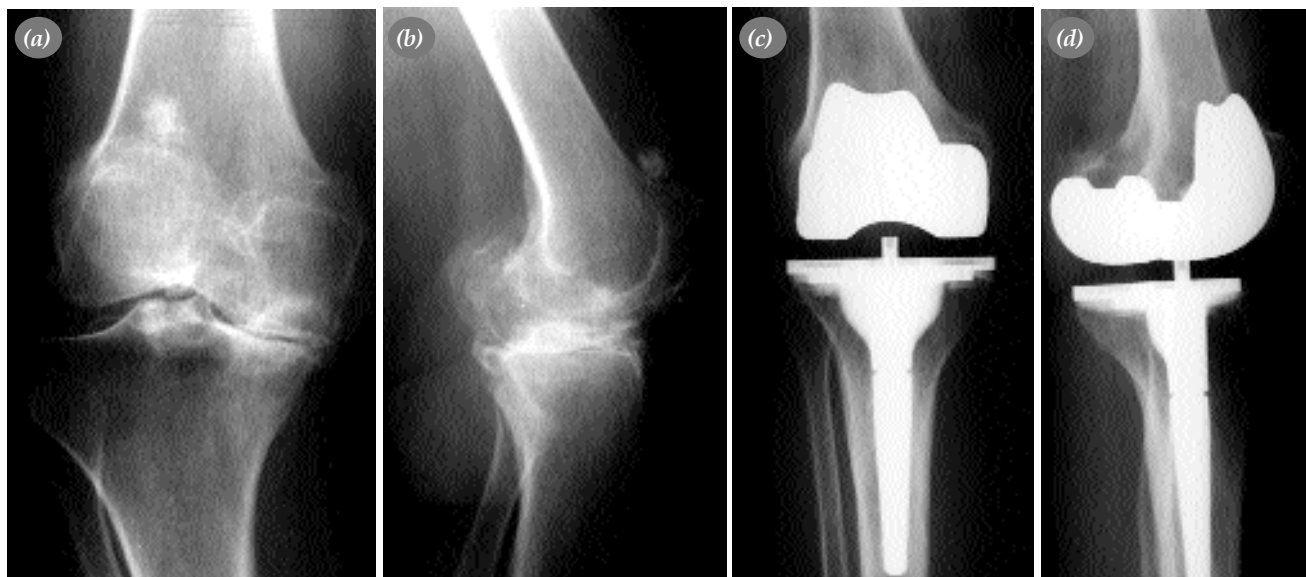
Figure 1. (a, b) Ahlbäck phase V degenerative changes are evident in the anteroposterior and lateral knee roentgenography of the sixty-two years old female patient. (c, d) The anteroposterior and lateral views 60 months after the total knee arthroplasty without patellar resurfacing.

Radiolucence was observed in zone 1 in one knee (1.7%), and zones 1 and 2 in one knee in Group 1; and in zone 1 in the tibial component in two knees (2.2%) in Group 2. The radiolucence was less than 2 mm in those cases.