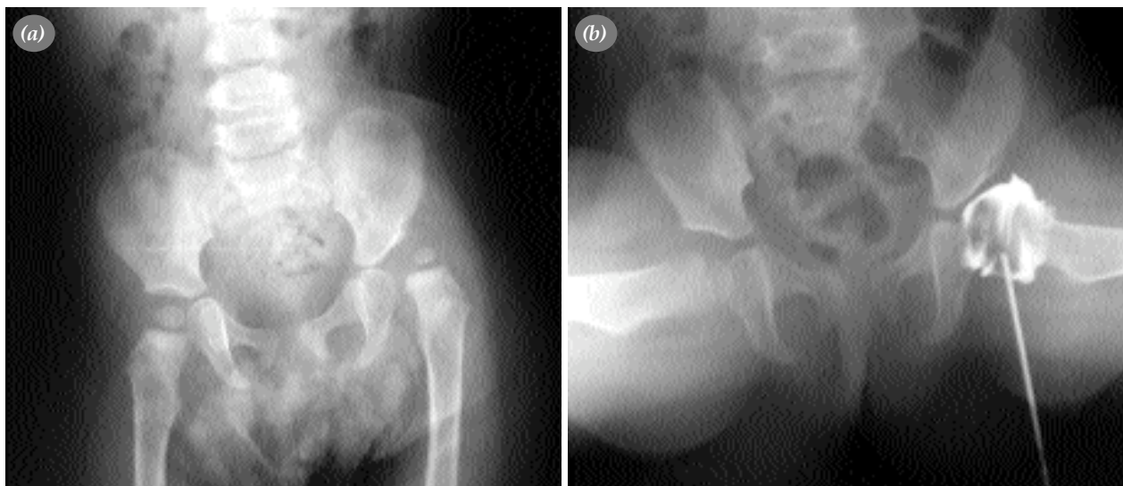
Figure 1 (a) Posterior-anterior pelvic graph of a 7 month-old baby girl with left hip dislocation. (b) Concentric reduction view of the same patient in human position after arthrography.

One of the most important decisions that a surgeon applying closed reduction should make is to determine the power to be applied for reduction. Surgeon should not need more force to maintain this after providing reduction. Also, excess positions should not be required for maintenance of reduction. It should be maintained in human position. This is hyperflexion and restricted abduction. In his clinical application, the author gives at least 90 degrees flexion position to the hip and avoids abduction position more than 45-50 degrees. If inner rotation movement in addition to excess abduction is needed to maintain reduction, this is a message indicating that closed method is not suitable for the patient and excess abduction and inner rotation must definitely be avoided. Second basic point is the quality of reduction. Acceptable reduction is arthrography controlled anatomic reduction. The surgeon should not hesitate about this.