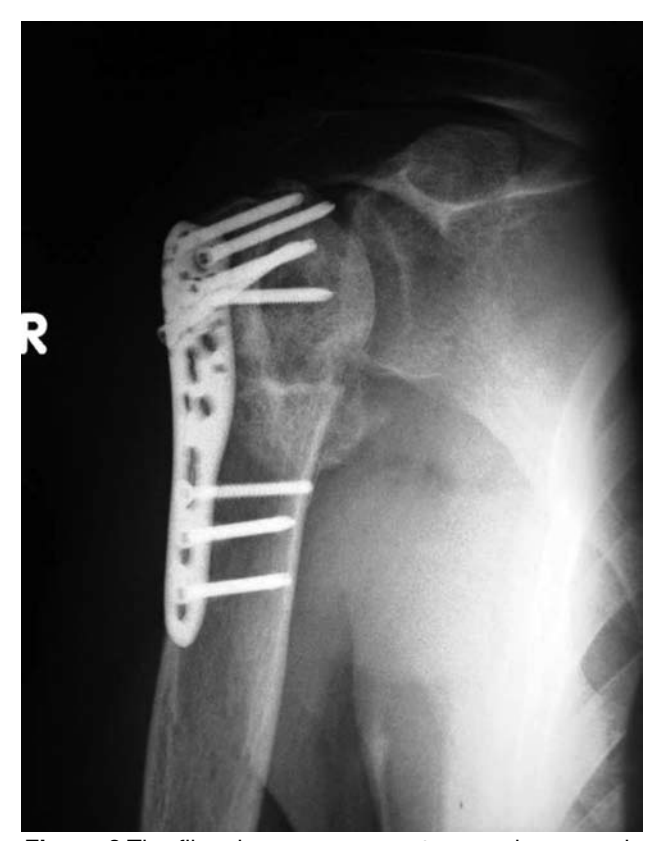
Figure 2. The film shows consequent avasculer necrosis after plate fixation.

In the open reduction and plate placement for the treatment of the proximal humerus fractures, especially when the osteoporotic fractures are concerned, loosening of the implant, subacromial impingement and AVN due to the peeling of the periostium and the soft tissues are considered as serious problems.<sup>[6,7]</sup> Fixation insufficiency ratio is high in the treatments done with T-buttress plates.<sup>[6]</sup> In a study performed