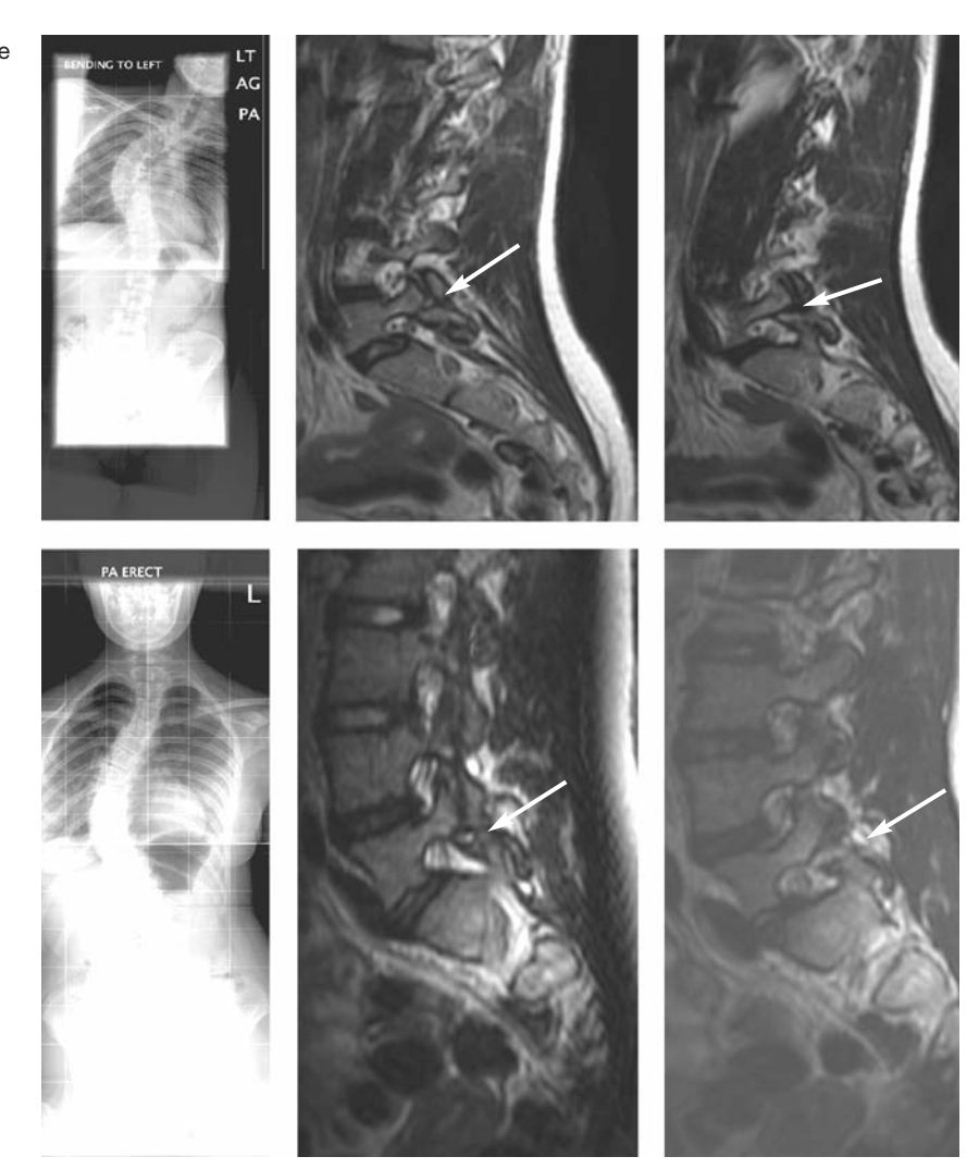
Fig. 1. Arrows pointing towards hypointense pars defects on sagittal images.