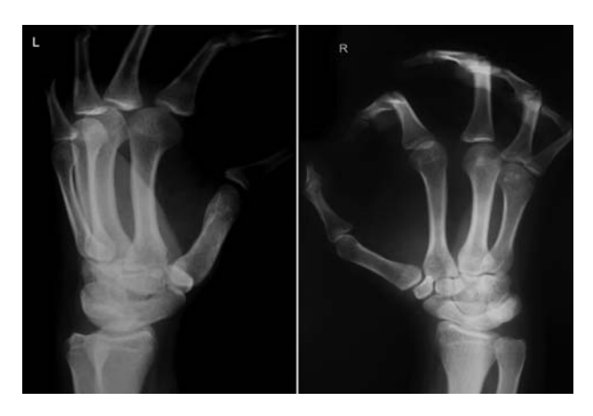
Fig. 4. Oblique view of the wrist showing the coalitions.

Unless syndrome related, carpal coalitions are usually an incidental finding. However, carpal coalitions may become symptomatic. Since there is no possibility of movements of the fused bones, pain may be caused by increased compensatory movements of the adjacent joints and soft tissue. <sup>[1,2]</sup> In incomplete coalition, because of the absence of intra-articular cartilage, there is a likelihood of degenerative arthritis due to stress loading. <sup>[3]</sup> Occasionally, patients may present with fracture of