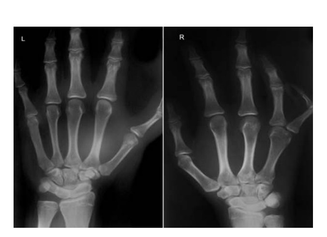
Fig. 3. Posteroanterior radiograph of the hands, showing the SLTC on the left and SLC with absent fifth ray on the right.

Lunotriquetral coalition has been classified by Minaar into four types which can be used to classify other coalitions as well. [6,9] Type 1 is an incomplete fusion resembling a pseudarthrosis, Type 2 is a proximal osseous bridge with a distal notch, Type 3 is a complete fusion of the lunotriquetral, and Type 4 is a complete fusion associated with other carpal