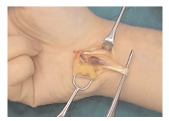
Fig. 1. The mass originating from the deep flexor tendon of the fifth digit is shown. [Color figure can be viewed in the online issue, which is available at www.aott.org.tr]

tendon of the third digit (Fig. 2). Histological examination of the mass was consistent with a ganglion cyst.