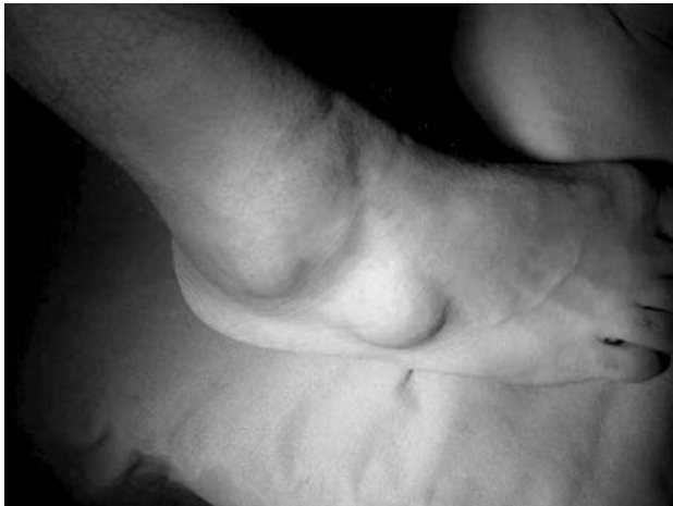
Fig. 1. The soft tissue mass on the dorsolateral surface of the right foot.

the skin but infiltrating the deep soft tissues. Laboratory tests were normal. Magnetic resonance (MR) images revealed hypointense soft tissue masses of 3×3 and 2×2 cm, adjacent to the calcaneus. The mass was well-lined, neither destructing the bone or soft tissues under the fascia (Figs. 1 and 2). Peripheral neural tumors, lipoma and pleomorphic sarcoma were considered in the differential diagnosis. An open biopsy was planned but intraoperative exploration revealed that the lesion had well-defined borders and marginal excision was decided. The tumor was resected and sent to the Pathology Department for examination. Macroscopic examination revealed two lobulated masses with shallow grooves. The larger mass was 3.5×3×2.5 cm and the smaller was 2.5×2.2×2 cm in diameter. Lesions were solid, gray-pink color flecked