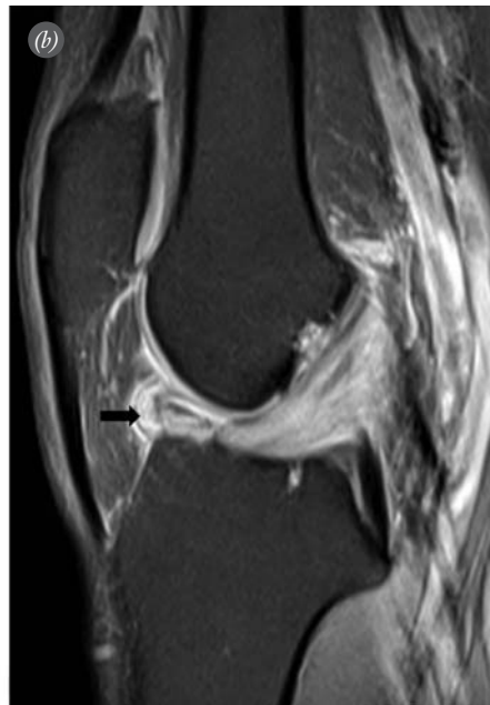
Fig. 1. Sagittal T2-weighted image (a) and T1-weighted image (b) showing a thickened and illdefined ACL with high inhomogeneous signal intensity and a huge mass (arrow) anterior to the tibial attachment of the ACL, which impinged on the intercondylar notch.

was suspected to be the cause of the knee motion limitation, the MRI findings alone were not sufficient to make a diagnosis. Therefore, we performed an arthroscopic excision of the mass with a biopsy in order to obtain a definite diagnosis.