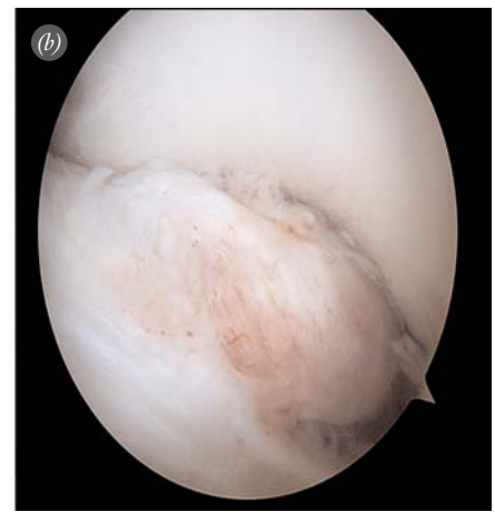
Fig. 2. (a) Arthroscopic view of a huge deformed mass arising from ACL fibers at the tibial attachment. (b) The mass impinged on the femoral intercondylar notch on knee extension, and the deformed shape allowed the mass to fit into the contour of the notch. [Color figure can be viewed in the online issue, which is available at www.aott.org.tr]

found a mass interspersed within the hypertrophied ACL at the femoral insertion. The mass impinged on the PCL and posterior capsule, and caused flexion limitation. Hsu et al. [6] reported on a mass of the hypertrophied ACL at the posterolateral bundle, which impinged on the tibiofemoral joint and caused extension block. It is the only reported case with a histologically confirmed degenerative mass. The present case was similar to that case in terms of clinical presentation and degenerative nature of the mass. However, the present case differed in that it involved a huge amorphous mass at the tibial attachment and around the whole ACL fiber.