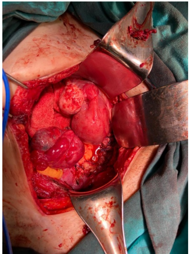
Fig. 3. The total right hemihysterectomy

addition to clinical findings, \beta -hCG measurement, ultrasonography (USG), and magnetic resonance imaging (MRI) are used. Diagnosis is made by observing the gestational sac in the cervix, trophoblastic invasion of the cervical wall, and typical uterus dimensions on USG (6).