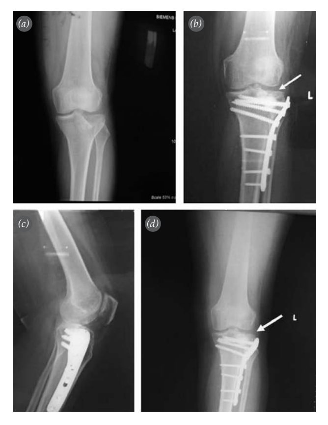
Fig. 2. (a) Radiograph of a 50-years-old female patient with a Schatzker II type fracture. (b) Early anteroposterior and (c) lateral radiographs of the knee after the calcium phosphate cement (CPC) augmentation of open reduction and internal fixation. (d) Incorporation of the CPC graft to the metaphyseal bone without loss of the reduction is observed on the radiograph at 10 months after surgery (arrow).

Although allograft may be considered as an alternative to resolve these aferomentioned problems of donor site morbidity, they carry several drawbacks such as transmission of viral infections, histological incompatibility, and low union rates. Full weigthbearing is also delayed after cancellous bone allografting.<sup>[5,7,12,13,15,16,24,27-30]</sup>